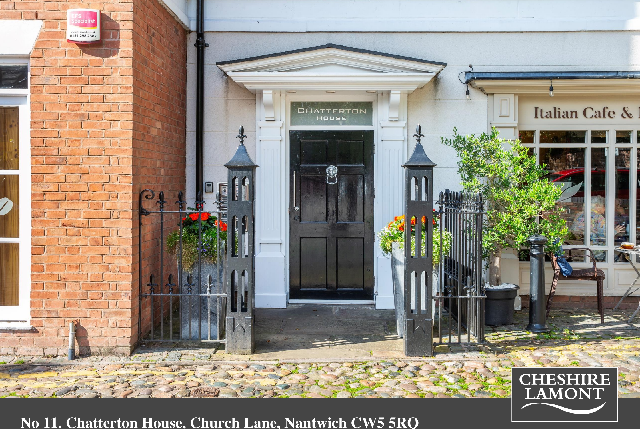
No 11. Chatterton House, Church Lane, Nantwich CW5 5RQ